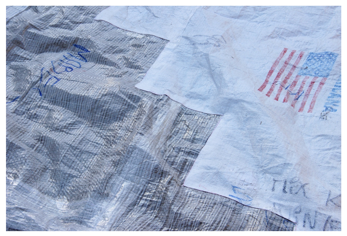
Espejo, 2019. Patchwork on synthetic burlap. 280 x 350 cm (detail)

The deafening noise of shouted-out offerings and bargaining: a din invading everything. Amid the narrow aisles that barely leave a passageway for the fair's crammed stands, the walk through is anything but a path allowing for introspective reflection. On the contrary, everything calls heightened attention to itself: outlandish decorations amid the cluttered merchandise and a hallucinatory repertoire of products that hawk themselves like overlapping pop-ups in some illegal but ubiquitous 'deep web.' A mix of cultural atavisms and the unstoppable tendency toward an anomalous future so close to science fiction that it defines the transnational perimeters of an irrepressible mixed-race, or chola , aesthetic. The combining of popular culture with an arrivisme , by now hardly a novelty, of emerging bourgeoisies that reorganize the map of economic power in the Andes region. In this tangled space, close to fever pitch, Candelaria Traverso has found the emotional and intellectual core of her work. She found it in the proliferating overlap of social technologies of highly dissimilar yet intermeshing times. And in a well calculated position of observation, an intermediary place somewhere between the distance of the ethnographer's gaze and the interested closeness of autobiography.